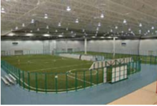
Exhibit D Photo examples of future CarolinaPlex sports center